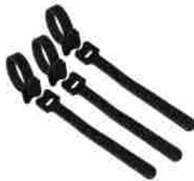
Hook and Loop Ties